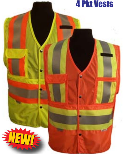
4 Pkt Vests