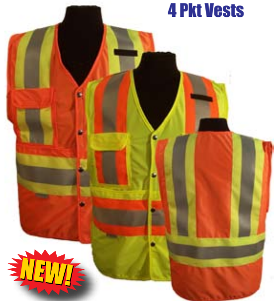
4 Pkt Vests