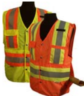
Poly Knit Solid